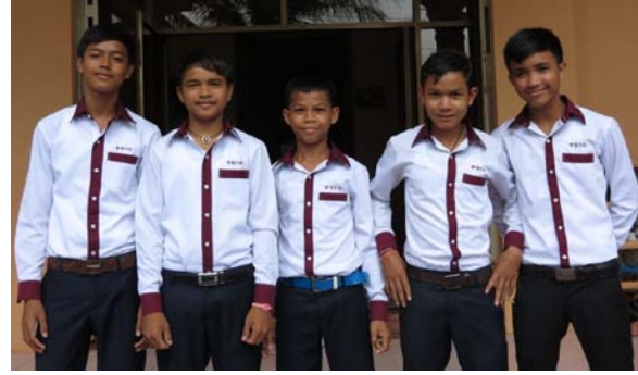
From L to R all High school girls and all High school boys.