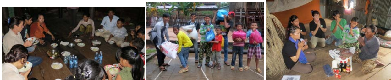
A visit to the Communities and sharing with the families with whom we work.

- Different games and fun activities in the Children's House.