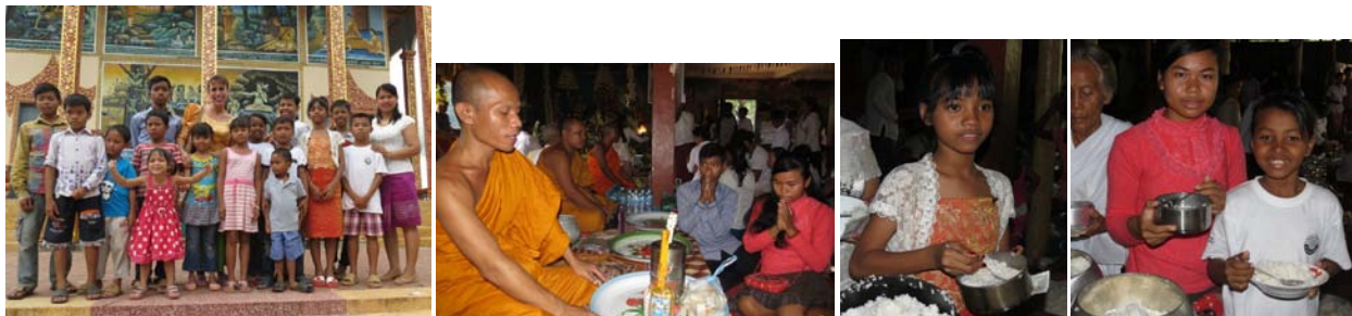
Observing the rituals that take place in the pagoda at this time.