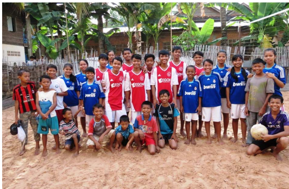
Real Madrid and Ajax donated their uniforms.