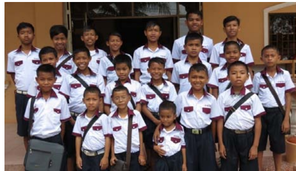
From L to R all girls primary school and all boys primary school.