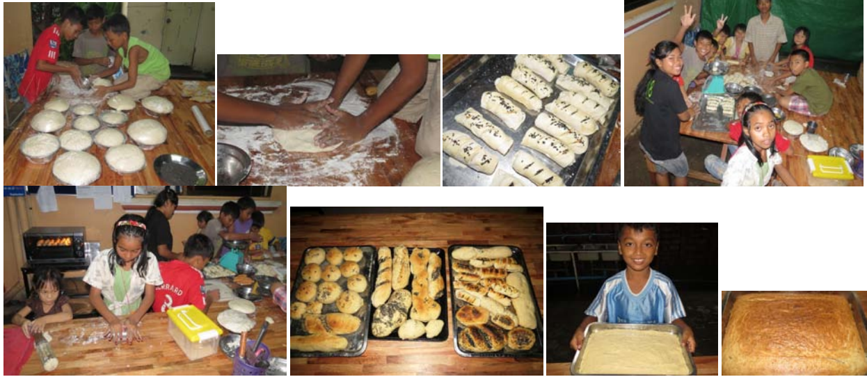
Cooking different types of bread and banana cake to celebrate the birthday of a friend. The Spanish tortilla is delicious!